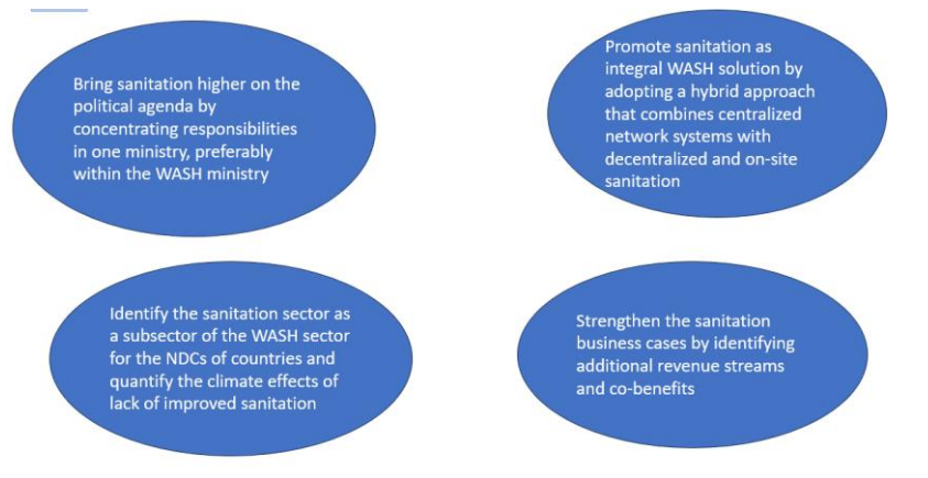
Figure 3: actions needed to increase visibility of the sanitation sector and attract more climate financing 12

Actions on 4 areas are needed, see next figure. These are in line with the incentives provided under para 4. There is one additional incentive specifically important for attracting climate financing and that is that sanitation should be made visible in the NDC reporting as one of the sectors or sub sectors. Only by showing the effects of improved sanitation on climate mitigation and adaptation efforts, it will be possible to attract climate financing to the sector.