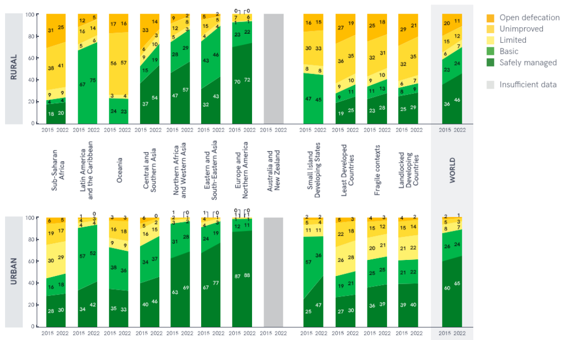
Figure 1: Regional sanitation coverage in urban and rural areas, 2015-2022 (%) (source: UNICEF/WHO, 2020)

There is a large gap in investment financing for sanitation infrastructure – less than 20% of the estimated $69 billion required annually for sanitation infrastructure to reach the SDG target is mobilized (AMCOW, 2022).