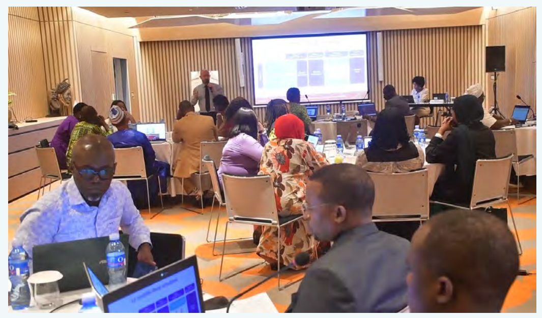
Training workshop on exchange of information - Abidjan (Côte d'Ivoire) - January/February 2023

Through presentations, practical case studies and an exchange of information simulation, participants deepened their understanding of the key concepts in tax transparency. The aim of the workshop was to guide participants towards more effective use of information exchange tools to support their audits and investigations, leading to more and better quality requests and more accurate responses to and from their foreign counterparts.