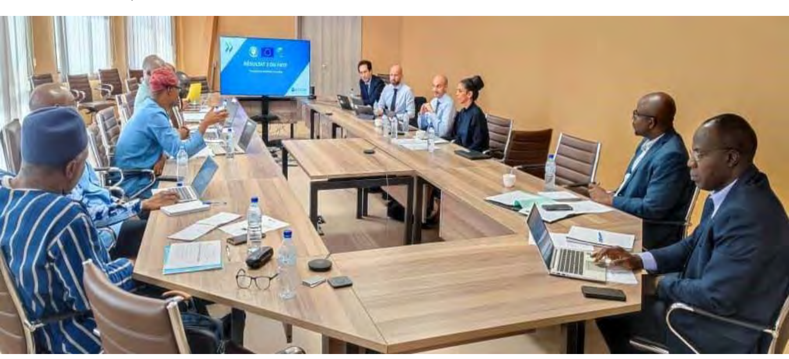
Meeting of representatives of the ECOWAS and UEMOA Commissions, the EU delegation to Burkina Faso, the OECD and the Global Forum - Ouagadougou (Burkina Faso) - September 2022

Director of Public Finance and Internal Taxation at the UEMOA Commission