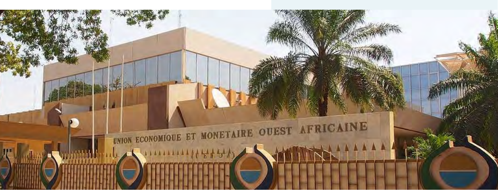
UEMOA Commission Headquarters - Ouagadougou (Burkina Faso)