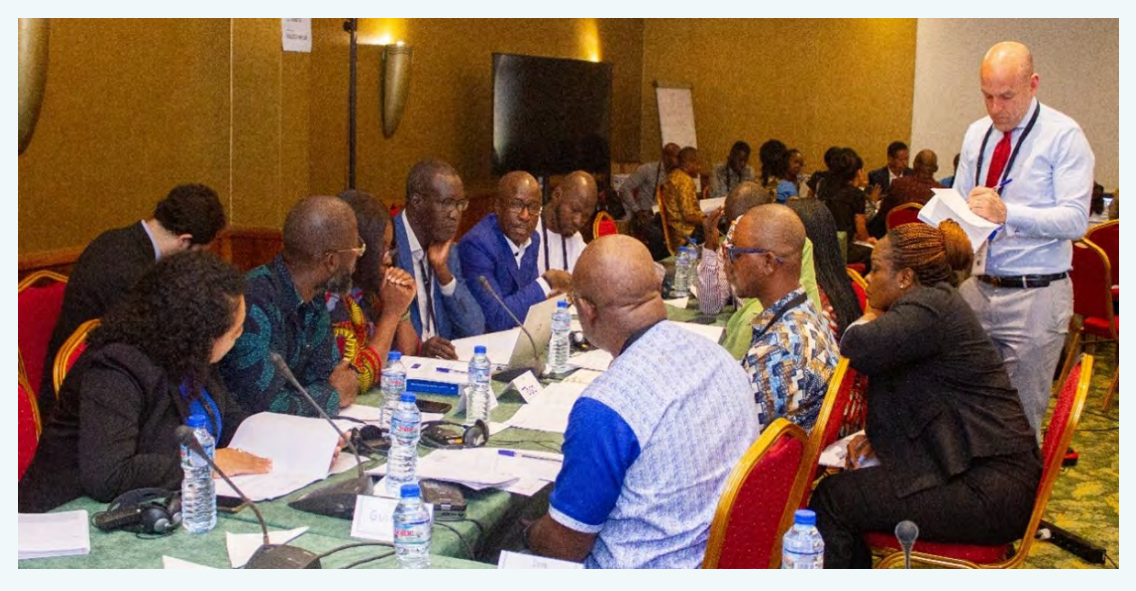
Training workshop on transfer pricing - Dakar (Senegal) - February 2023

As part of the three-year transfer pricing training cycle, the OECD organised a training workshop from 7 to 9 February 2023 in Dakar (Senegal), attended by thirty officials from the tax administrations of the 16 West African States and the ECOWAS and UEMOA Commissions. The workshop focused on the alternative approaches that developing jurisdictions could consider utilising to address the challenges posed by the lack of comparable data and the difficulties in accessing such data for transfer pricing analysis, which are also presented in the toolkit for addressing difficulties in accessing comparable data for transfer pricing analyses<sup>14</sup> developed by the Platform for Collaboration on Tax.<sup>15</sup> Through this workshop, which included real-life case studies, participants acquired knowledge and know-how to remedy the difficulties of accessing comparable data, which is one of the major concerns of tax auditors in developing jurisdictions when auditing multinational enterprises operating on their territory.