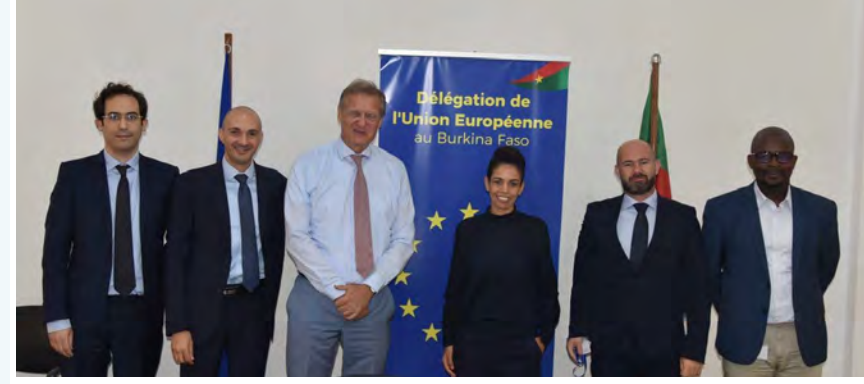
Meeting of representatives of the EU delegation to Burkina Faso, the OECD and the Global Forum - Ouagadougou (Burkina Faso) - September 2022