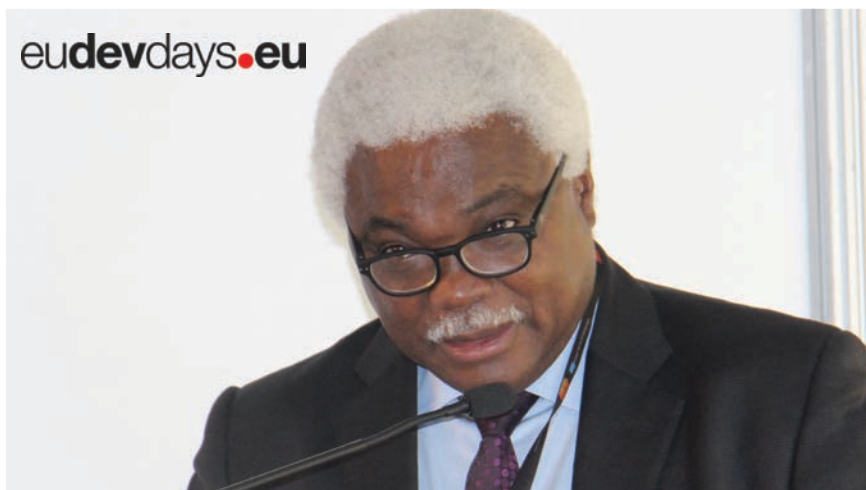
Session Moderator Jean-Pierre Elong-Mbassi, Secretary General, United Cities and Local Governments of Africa (UCLGA)

The availability of disaggregated data broken down by agglomeration allows for spatial structure analysis. This could provide insights on a number of important issues, such as what urban policies would enable towns to respond to the increase in populations vulnerable to food insecurity. What types of investment in agriculture are necessary in light of the decreasing available manpower in rural areas? What type of policies and programmes are needed to strengthen the linkages between rural and urban areas?