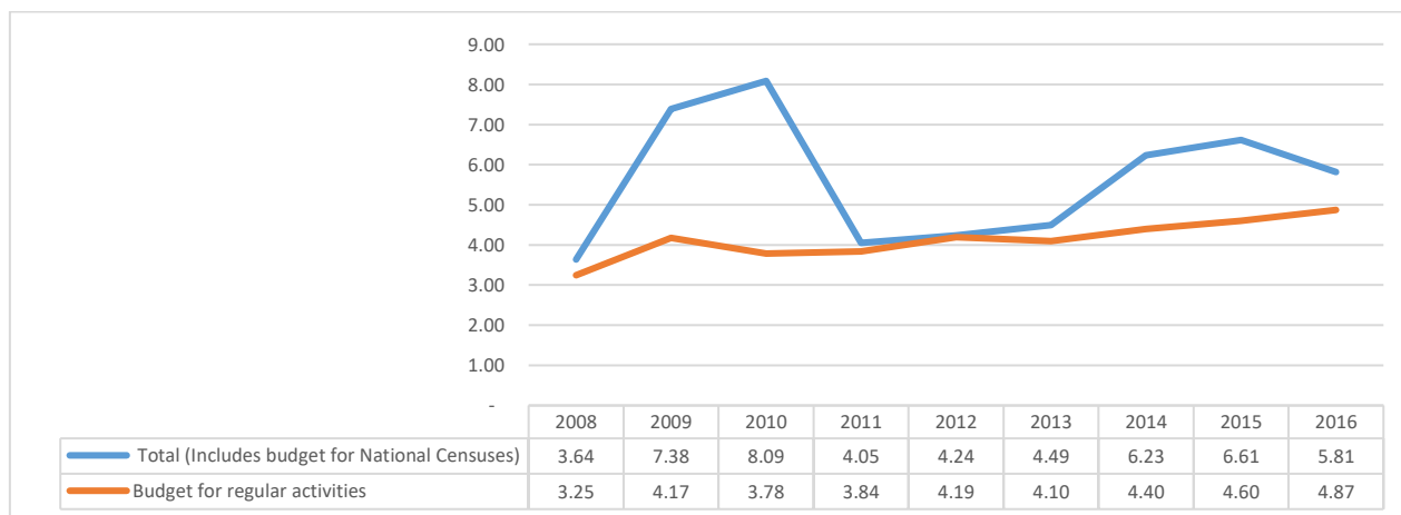
Figure 3.1: INEGI’s Approved Budget, 2008-2016 (Constant Mexican pesos 2008 = 100, billions)

Note: Original budget approved by Congress.