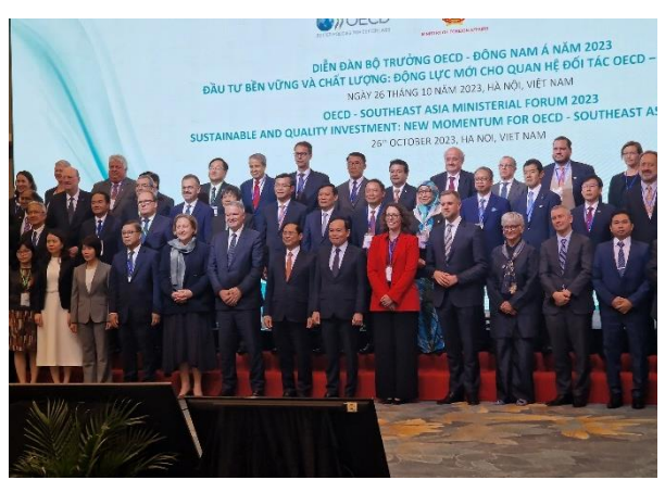
Heads of delegation at the 2023 Southeast Asia Ministerial Forum, October 2023.

The major event of 2023 was the Ministerial Forum held in Ha Noi, Viet Nam, on 26-27 October – the third ministerial-level event held since the beginning of 2022. Themed "Sustainable and Quality Investment: New Momentum for OECD -Southeast Asia Partnership", the underscored the OECD's role in supporting investment policy reform in the region and the potential for its standards and policy recommendations to contribute to investment promotion and better sustainability outcomes from FDI. Participants recognised the Programme's strong record of supporting investment policy