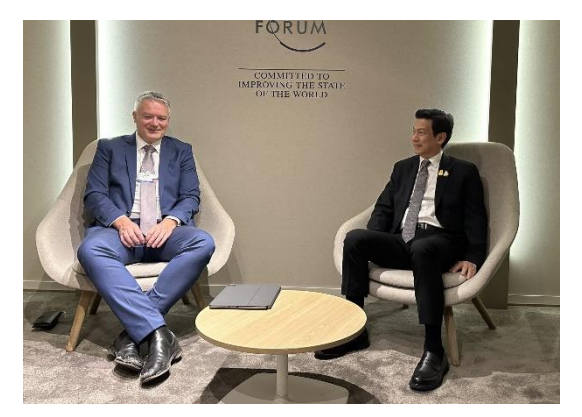
OECD Secretary-General Matthias Cormann and Deputy Prime Minister and Foreign Minister of Thailand, Parnpree Bahiddha-nukara, discuss Thailand's membership aspirations at the World Economic Forum in January 2024.

The <u>OECD Council Decision</u> that established SEARP in 2013 explicitly recognised the Programme's potential to 'eventually lead to more interest in membership'. Since 2014, SEARP has been working closely with countries and institutions in the region, supporting Southeast Asia in its domestic reform and regional integration priorities and increasing awareness of the OECD. As this Activity Report makes clear, our relationship is now both deep and broad-based, with dozens of new activities and publications being added every year. Thailand and Indonesia's decision to seek OECD membership is a testament to SEARP's success in building a closer OECD-Southeast Asia relationship.