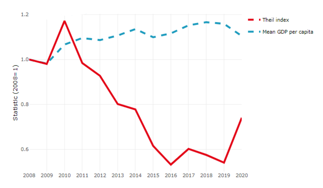
Figure 1. Trends in GDP per capita inequality indicators, TL2 OECD regions

Chile experienced a decline in the Theil index of GDP per capita over 2008-2020. Inequality reached its maximum in 2010. The figures are normalized, with values in the year 2008 set to 1.