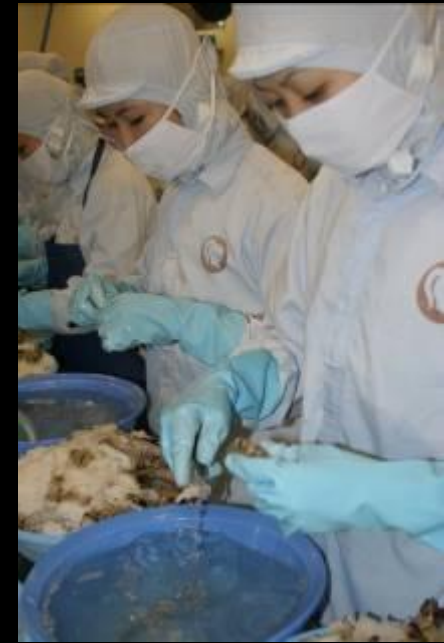
Processing (in use)