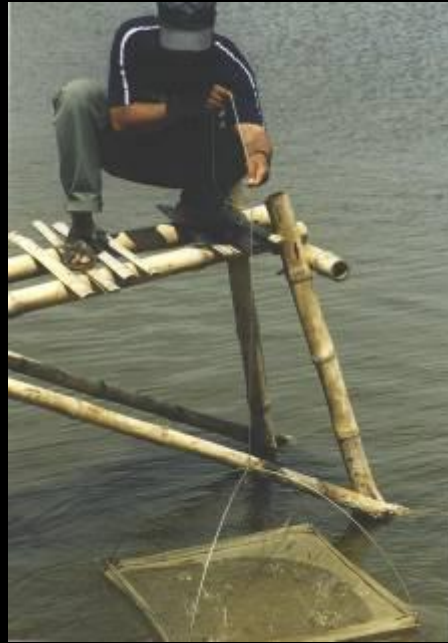
Farm (in use)