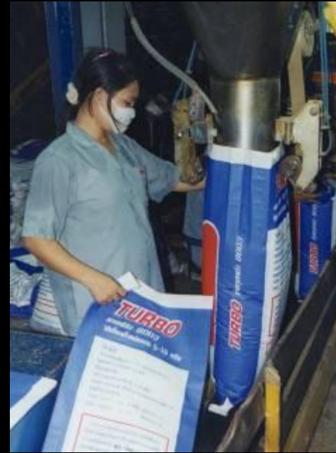
Feed mill (in prep)