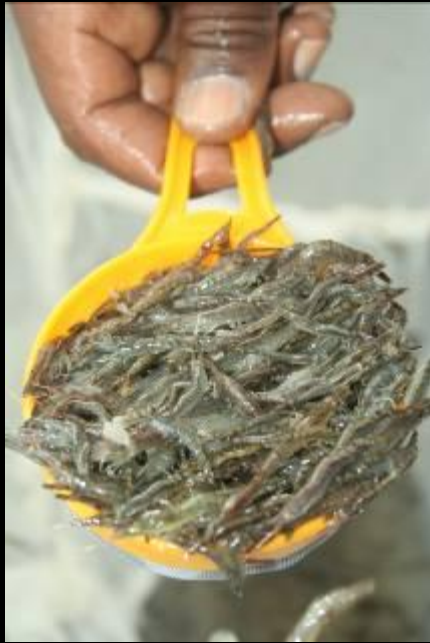
Hatchery (in use)