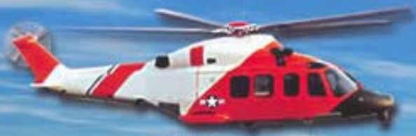
VTOL Recovery and Surveillance Aircraft (Future System)