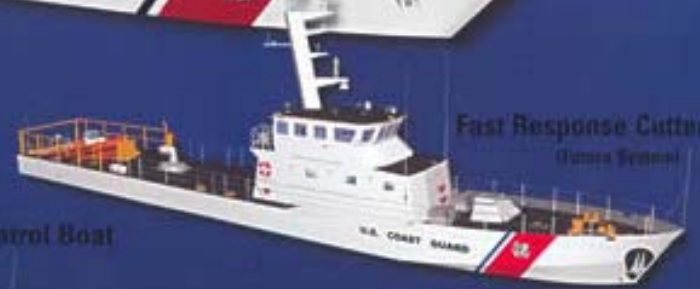
Fast Response Cutter (FRC) (Future System)