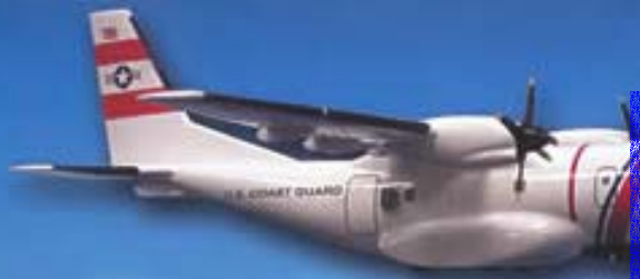
Maritime Patrol Aircraft (MPA) CASA 235-300M