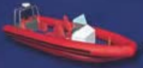
Short Range Prosecutor (SRP)