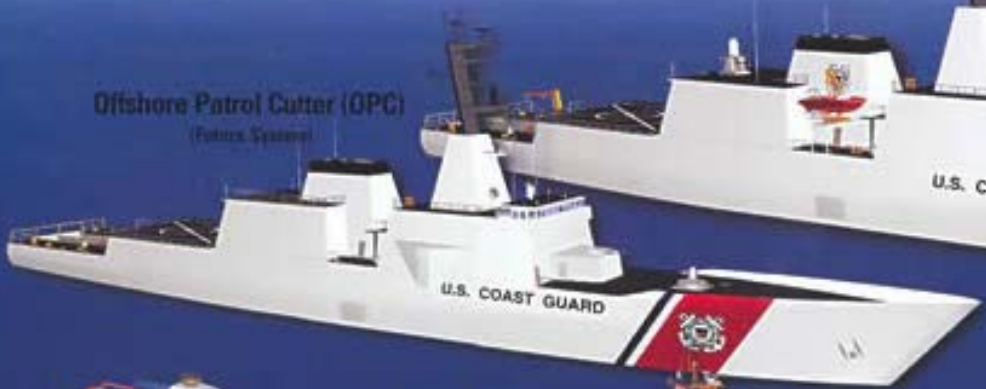
Offshore Patrol Cutter (OPC) (Future System)