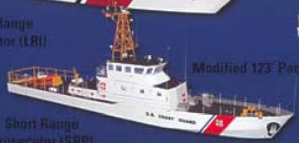
Modified 123 Patrol Boat