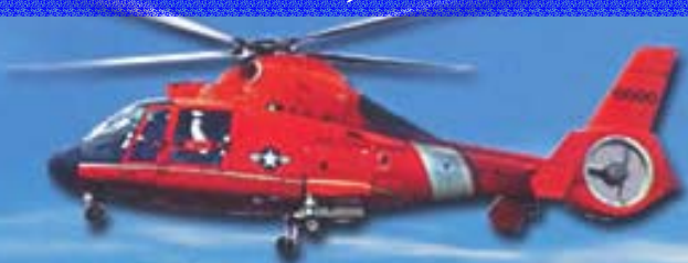
Multi-Mission Cutter Helicopter (MCH)