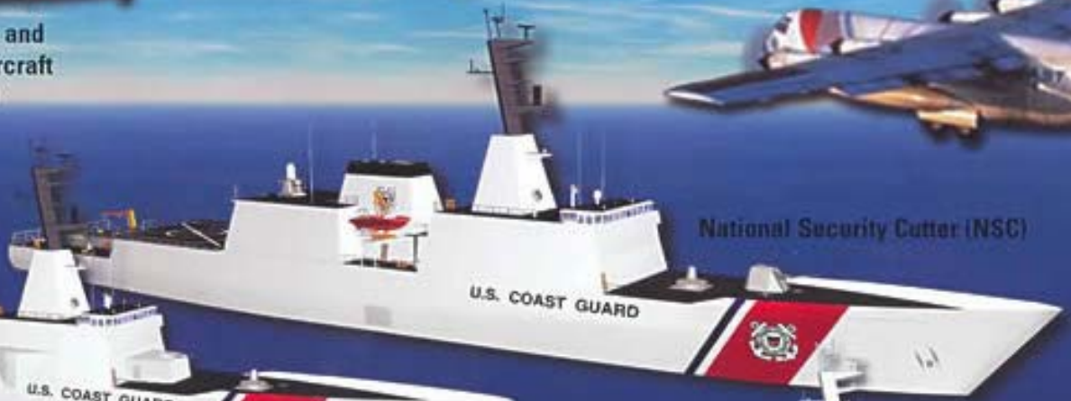
National Security Cutter (NSC)