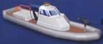
Long Range Interceptor (LRI)