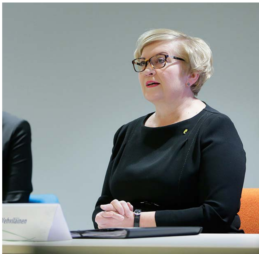
Ms. Anu Vehviläinen , Minister of Local Government and Public Reforms, Finland, Chair