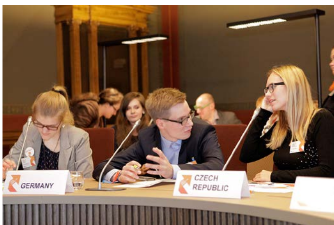
Students from Germany and Czech Republic engage in discussions at the Youth Dialogue in Helsinki, on 27 October.

During yesterday's Youth Dialogue we were called to ensure access and space for youth to truly influence decision-making at the national, regional and local levels, to listen to youth, and to support multiple channels and institutions for them to translate engagement into action.