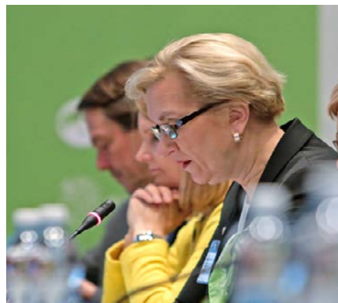
Ms. Katju Holkeri , Finland

A culture shift in support of inclusive growth is dependent on the commitment to work together across government in achieving these goals. Our Centres of Government will play a critical role in steering us towards a more cohesive approach in delivering our collective vision. We need to align vision, incentives and delivery mechanisms across ministries and at all levels of government. We need to ensure governments can act fast when needed and overcome administrative silos.