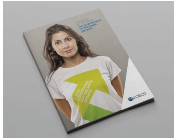
The Governance of Inclusive Growth, OECD, 2015

Ultimately, this will require a change in the culture of the public sector going beyond technical efficiency to the creation of public value where the civil service aims to deliver better services to all and strengthen the legitimacy of, and confidence in, public sector institutions in the eyes of the public.