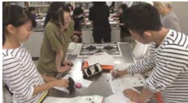
Taking Responsibility, Japan, Home Economics