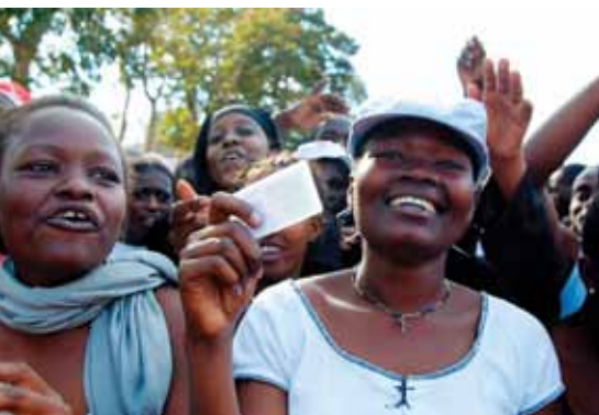
Photo: Vijana Tugutuke (Youth Arise) Voting Campaign, Kenya. © Thomas Omondi / DFID

How do we measure the success of our democracies? Whether we like it or not, leaders and their constituencies implicitly judge democracies on economic growth. More explicit attempts to evaluate democracies – such as the Freedom House Index, Afrobarometer and Mo Ibrahim Governance Index – focus heavily on institutional criteria. The research adds a new and complementary standard: the degree to which a democracy fosters a sense of citizenship . We need indicators that reflect that. Learning or gaining citizenship is not only a legal process of being defined as a citizen, but involves the development of citizens as actors, capable of claiming rights and acting for themselves.