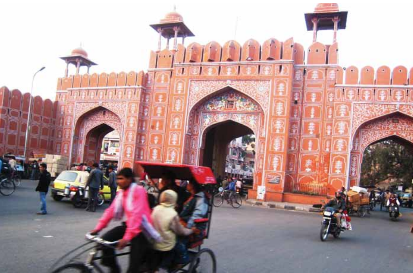
Photo: Jaipur, India, December 2009.

in some countries, such as Zambia, through political parties. 29 However, in the absence of parties with clear programmes, or formal or informal requirements for inclusivity, elections may not be an effective vehicle to achieve lasting elite bargains. 30 In countries like Ghana, an informal convention has meant that the presidents have generally included people from the major regions and ethnic groups in their governments. 31 More formal provisions for inclusive government are in place in Nigeria, where the ‘Federal Character Principle’ informs appointments to ensure that major groups participate in power. 32