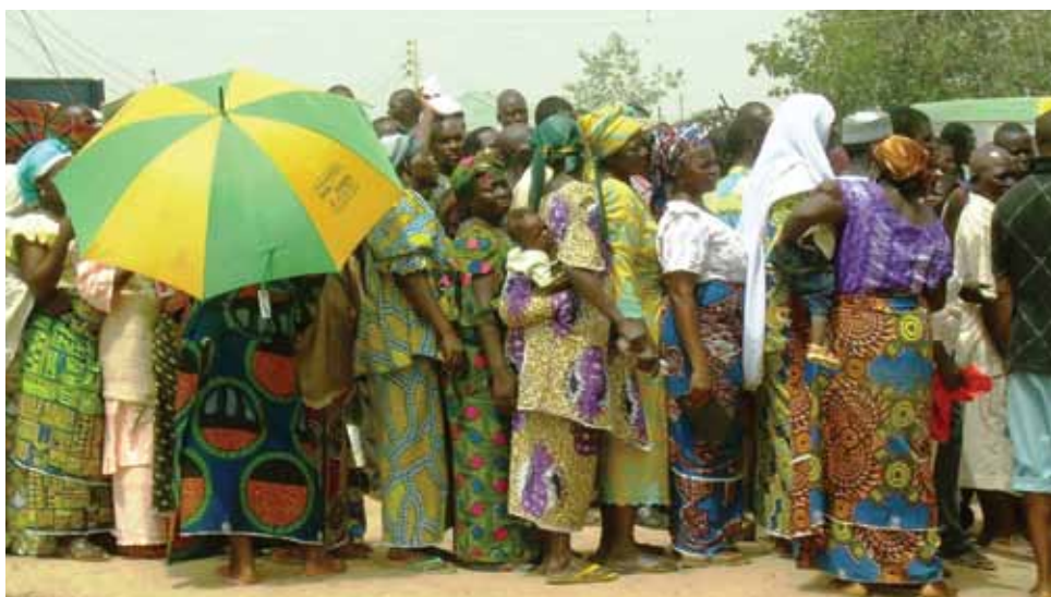
Photo: Women voters queuing, local government elections, Nigeria.

The social legitimacy of political settlements plays a central role in the durability of such settlements. Tanzania is a case in point, where the enduring legacy of post-colonial nation-building continues to influence contemporary political processes. 43