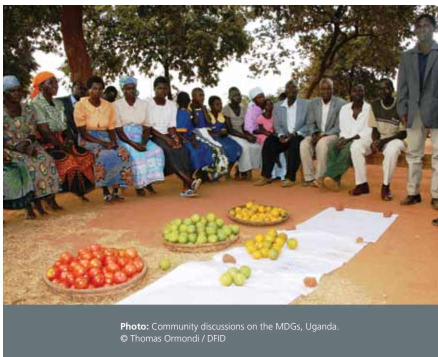
Photo: Community discussions on the MDGs, Uganda. © Thomas Ormondi / DFID

The way services are reorganised or delivered clearly affects opportunities for collective action . This underlines the need to understand the impact of all public policy interventions on the ability and incentives of different groups to mobilise. For instance, the existence of the private licence-holder in the case of the Public Distribution System for providing subsidised food grain enabled public officials in Delhi to demand better performance without publicly criticising their own colleagues. 184 In Mexico, the central government, as well as many state-level governments, have formal agreements with social organisations to collaborate on the design and implementation of social policy. Chief among these collaborations is reproductive health policy, in which NGOs and the government would work together to improve services and breadth of coverage. The Inter-Institutional Group on Reproductive Health gave the women's movement in Mexico privileged access to forums for policy design and monitoring. As a result of the strong relationships between public institutions and NGOs, many of the services provided and advocated by the NGOs have since come under government remit, representing a successful use of social accountability for positive policy change. 185