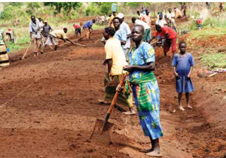
Photo: Community road-building in northern Uganda.

While there are many examples of the contributions of citizen engagement to building responsive states, these do not always occur. In other examples, engagement can lead to elite capture, clientelism and patronage , or increased frustration of those involved. Moreover, the types of strategies and outcomes that can be expected vary a great deal according to context. 158 Yet these are dependent in turn, on a combination of the forms of mobilisation used and the political contexts in which they occur. In fragile states or emerging democracies, associational forms of citizen mobilisation may contribute most importantly to the constructing of