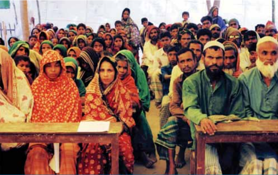
Photo: Bangladesh adult education class.

Recognise that citizenship can be exclusionary as well as an inclusive.