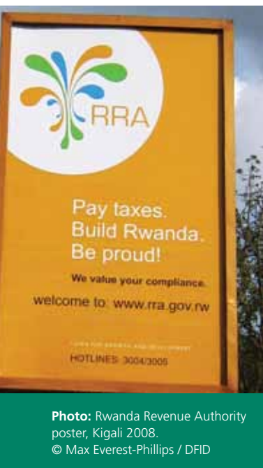
Photo: Rwanda Revenue Authority poster, Kigali 2008.