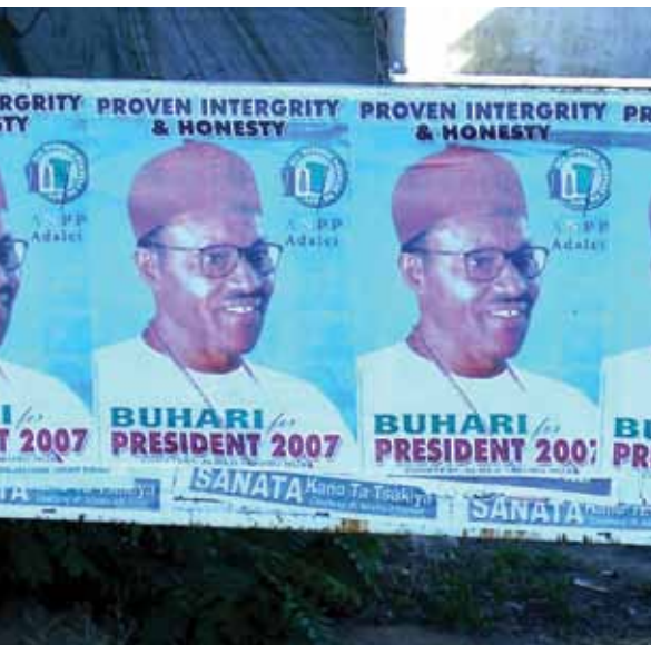
Photo: Campaign posters for the 2007 Nigerian presidential elections.