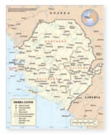
Figure 1. Map of Sierra Leone