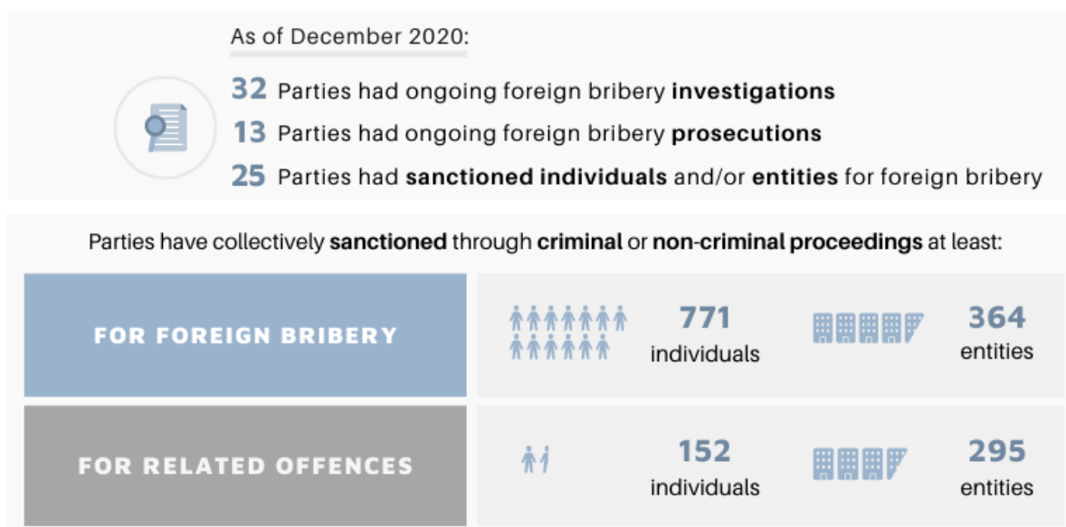
Figure 4. Highlights from the 2020 enforcement data

For more on the Working Group's views on enforcement, see its publication entitled Enforcement is the Key! Submitted to the United Nations Office on Drugs and Crime for the U.N. Special session of the General Assembly against corruption (UNGASS).