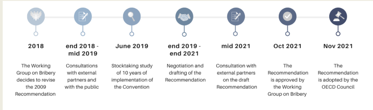
Figure 3. Timeline for the Working Group on Bribery Negotiation of the 2021 Anti-Bribery Recommendation

In addition to enhancing the provisions of the 2009 Recommendation, the 2021 Recommendation covers topics that have emerged or significantly evolved in the anti-corruption area. Key elements include: