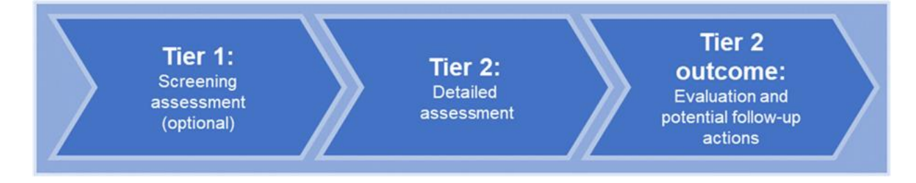
Figure 1. The different Tiers of the Early4AdMa system

It should be noted that the focus of the development of the current version of the system was on Tier 2. Therefore, Tier 2 is more developed and ready-to-use, whereas part of Tier 1 (e.g., scanning of the field) should be regarded as a suggestion for screening considerations, but not as a concrete guideline. In future versions of the system, Tier 1 may be further developed or may refer to approaches published elsewhere.