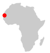
Population (in million)