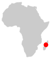
Population (in million)