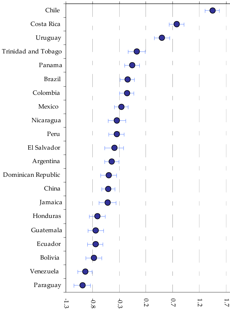
Figure 1.4. Control of Corruption, 2005

Scale: Distance (in standard deviations) with respect to world average.