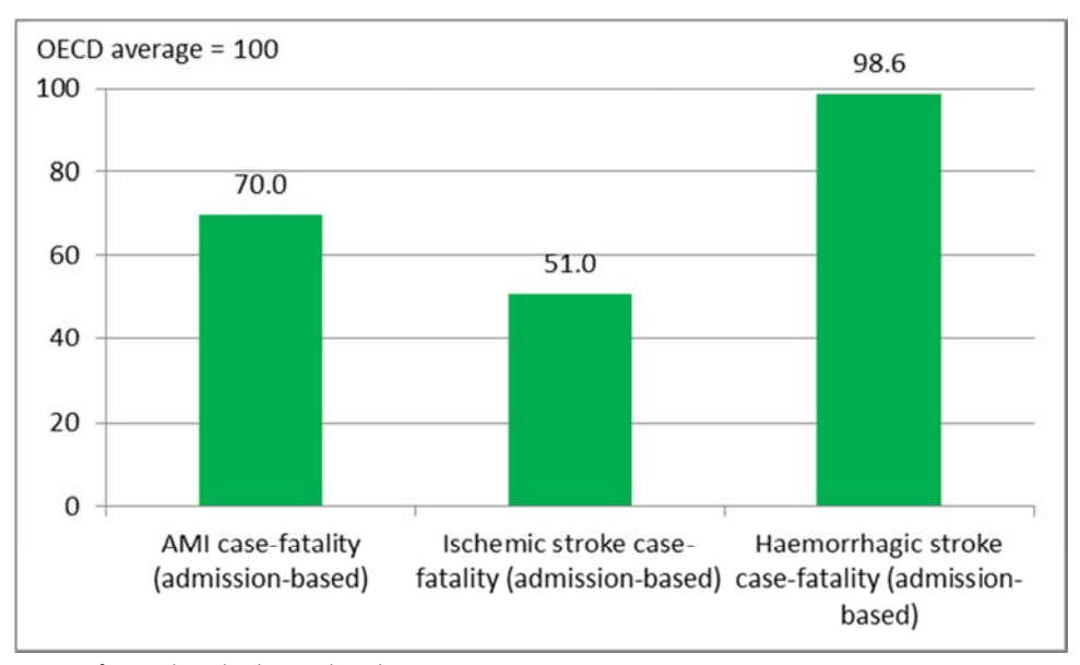
Figure 4. Acute care related to CVD and diabetes in the United States, 2011 (or nearest year), OECD average = 100

Quality of acute care for CVD is good in the United States (Figure 4). The 30-day case-fatality rates for patients admitted to hospitals with AMI and Ischemic stroke are 5.5% and 4.3%, much lower than the OECD average of 7.9% and 8.4%, respectively. The case-fatality rate for Haemorrhagic stroke, at 22.3%, is also lower than the OECD average of 22.6%.