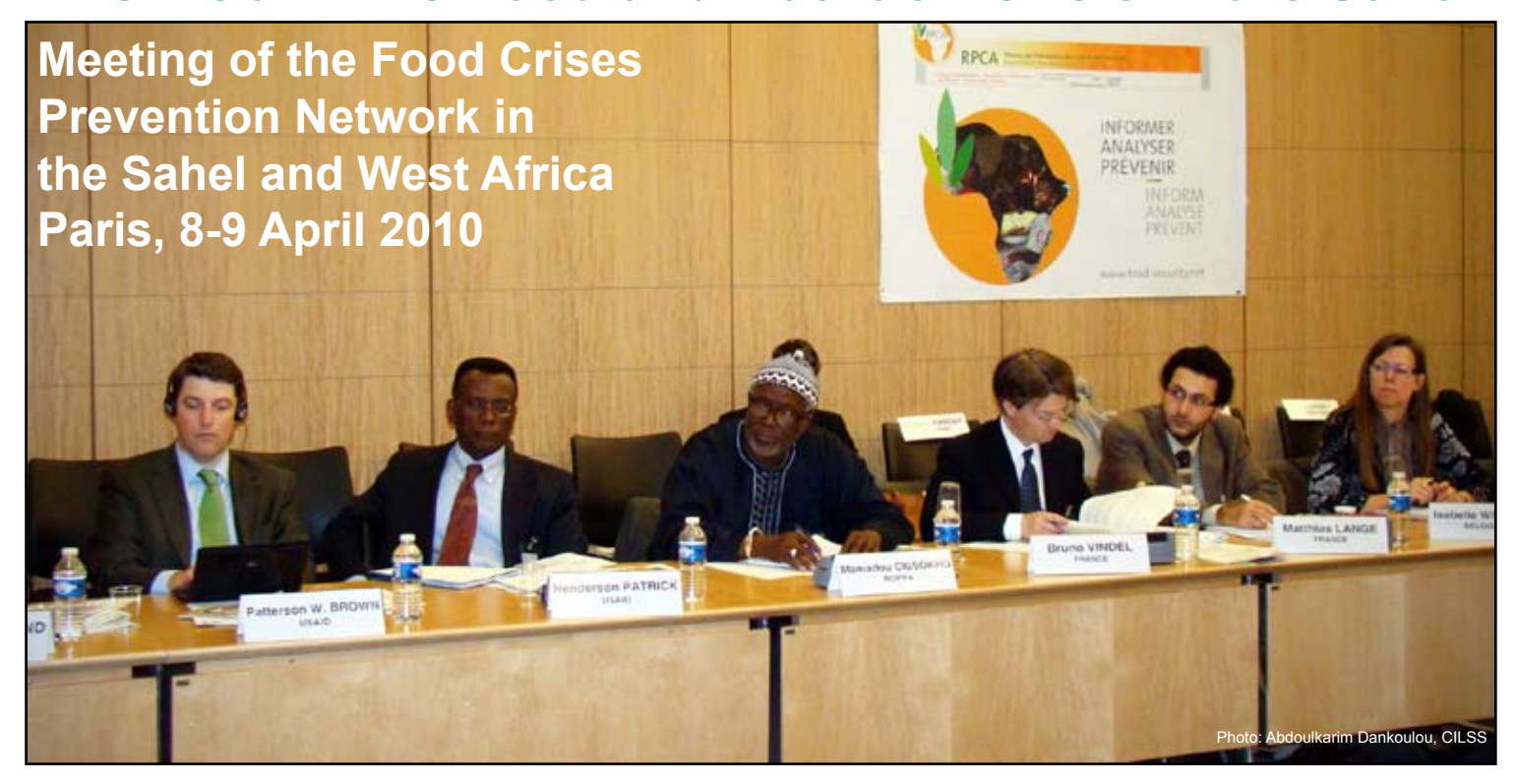
Members of the RPCA discuss the food and nutritional situation in the Sahel region at the OECD Conference Centre

Members of the Food Crisis Prevention Network (RPCA) unanimously confirmed that the Sahel region is facing a serious food and nutrition crisis. This analysis follows annual assessments of regional crop and food security, meetings of organizations responsible for food crisis management and prevention, as well as individual country appeals.