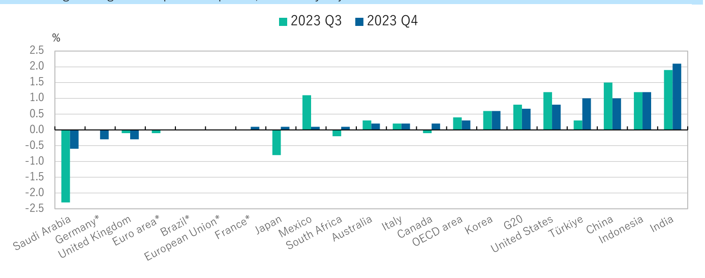
Figure 1 – Gross domestic product (quarter-on-quarter change) Percentage change on the previous quarter, seasonally adjusted data

* In Q4 2023, Brazil, the euro area and the European Union recorded zero growth. In Q3 2023, Brazil, France, Germany and the European Union recorded zero growth.