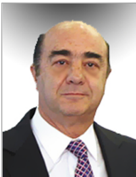
Jesús Murillo Karam

Secretary Ministry of Agrarian, Territorial and Urban Development (SEDATU)