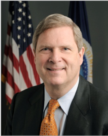
Thomas J. Vilsack Secretary of Agriculture United States

Tom Vilsack was appointed by President Barack Obama as the 30th Secretary of the U.S. Department of Agriculture (USDA) and sworn into office on January 21, 2009. As Secretary of Agriculture, Vilsack is working hard to strengthen the American agricultural economy, to revitalize rural communities, to protect and conserve our natural resources, and to provide a safe, sufficient and nutritious food supply for the American people. Because USDA's work affects every American every day, we are proud to be the 'Every Way, Every Day' USDA. As Agriculture Secretary, Vilsack has worked to implement President Obama's ambitious agenda to turn around the economy and put Americans back to work. USDA has supported struggling farmers and ranchers, provided food aid to 1 in 4 Americans, and worked to create jobs and build a foundation for future economic growth – especially in rural America.