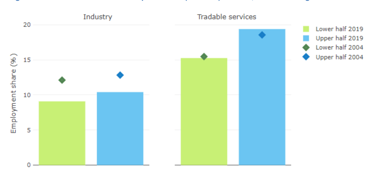
Figure 3. Share of workers in most productive (tradable) sectors, TL2 OEDE regions

Regions where the economic activity shifts towards tradable activities, such as industry and tradable services, tend to grow faster in terms of labour productivity. In Australia, between 2002 and 2020, the share of workers in the industrial sector went down in all regions but more so in regions that were already in the lower half of the labour productivity distribution. Hence, the evolution of employment shares in the industrial sector widened the labour productivity gap between regions. At the same time, the share of workers in the tradable services sector went up in all regions, approximately by the same amount.