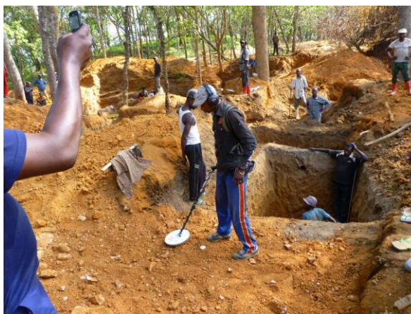
Figure 2. Using metal detectors to find gold at Musebe gold mine

Diggers distinguish between two types of material from the Musebe pits: strongly mineralised and less mineralised. For the latter, the process is that the material is dried, and then placed in diesel-powered rock crushers, whose operators (known as katwagas ) charged pit teams at the time of research CF15,000 (US$16.24) per 75kg load. After rock crushing, the resulting flour is washed in drums and then the gold is separated