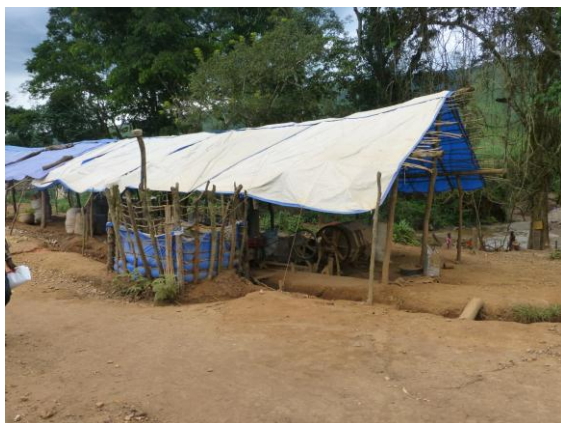
Figure 4. Rock crushing equipment at Musebe

Rock crushers furthermore reported that they were being issued receipts on photocopied paper, without the sums they had paid. Outraged, rock crushers at Musebe went on strike during the time of research, saying they would not resume work until the matter was resolved. 20 Diggers, already angered at allegedly being forced illegally by SAESSCAM to pay US$12/year for diggers' cards rather than the statutory US$5, marched in protest, saying