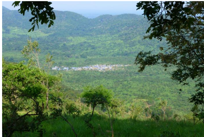
Figure 1. Musebe town, from the hill where gold is mined

interviewed for the study openly said that the present system should be retained, but the obstruction of the establishment of a centre de négoce by some government officials suggests that they too appear to prefer and benefit from the current lack of transparency.