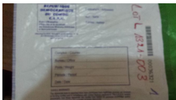
Figure 5. Prototype sealed envelope for gold from Musebe

VIMATED has accused Division des Mines and SAESSCAM agents in Musebe, particularly those from Nyunzu, of blocking the establishment of a centre de négoce , allegedly because