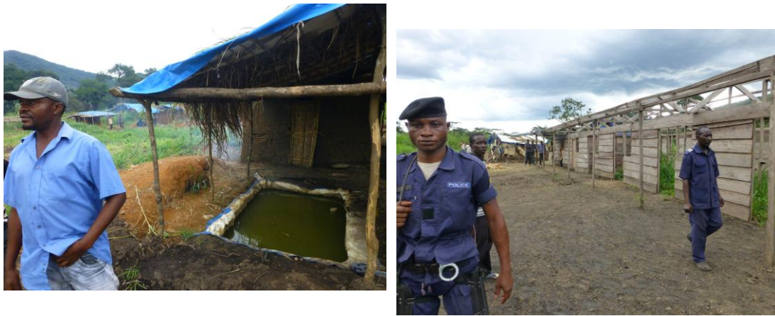
Figure 6. The Musebe Centre de Négoce

the current system makes it easier for them to collect illegal taxes. Land for the Musebe centre has already been identified and cleared and at the time of research, construction had begun of a washing tank and of offices for négociants and government agents. Yet VIMATED has alleged that the Nyunzu Division des Mines has ordered négociants , rock crushers and washers not to relocate to the centre de négoce until VIMATED has teamed up with a single operator. 30 The heads of the Division des Mines in Kalemie and Nyunzu have confirmed that they hope a single operator will establish itself in Musebe 31 , but have thus far declined to respond to questions about whether their officials have indeed ordered that the centre de négoce should not function until that time.