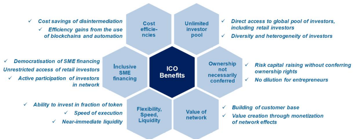
Figure 2. Benefits of initial coin offerings