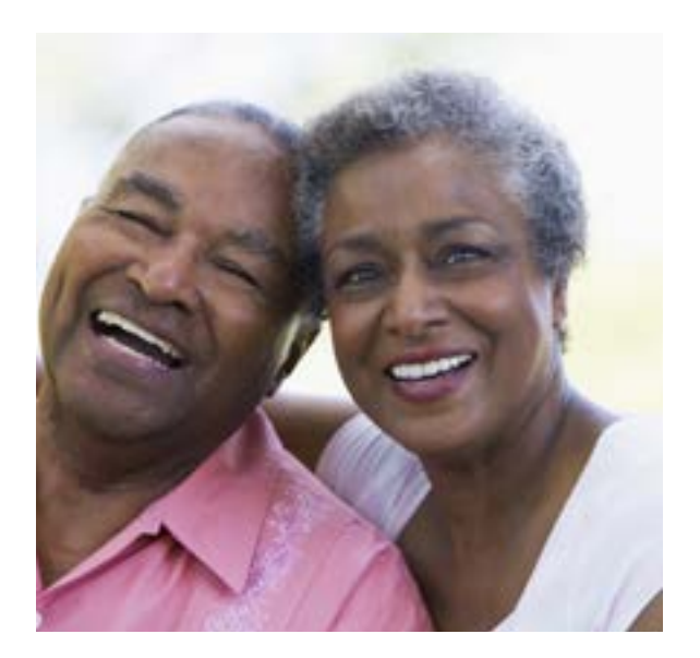
Promoting healthy ageing has significant payoffs – for well-being and for the economy

Good health can extend the working lives of older adults by reducing the time spent out of work in poor health and health-related early retirement. Obesity, smoking, heavy alcohol use, and chronic diseases are all associated with lower rates of employment: OECD work shows that non-obese older adults between the ages of 50-59 are 22% more likely to be employed than those who are obese (OECD, 2016).