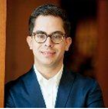
Entrepreneur in Resident, Angel Ventures Mexico