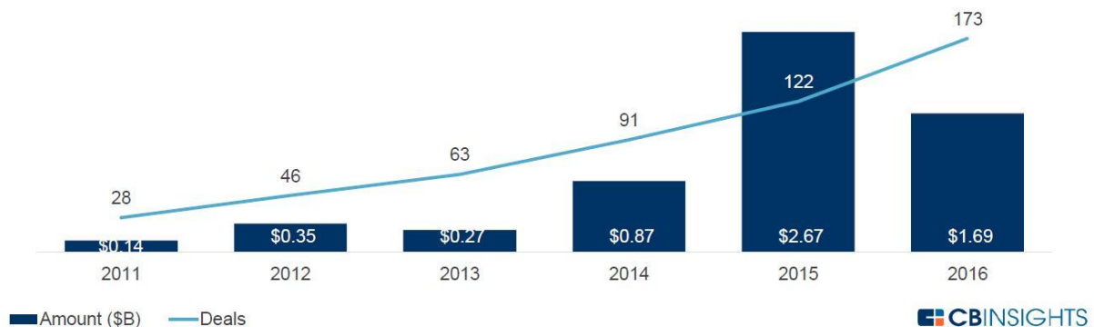
Figure 1. InsurTech financing trend (2011-2016)

Source: CB Insights (2017a) Insurance Tech Start-ups Raise $1.7B Across 173 Deals in 2016 www.cbinsights.com/blog/2016-insurance-tech-funding/ .