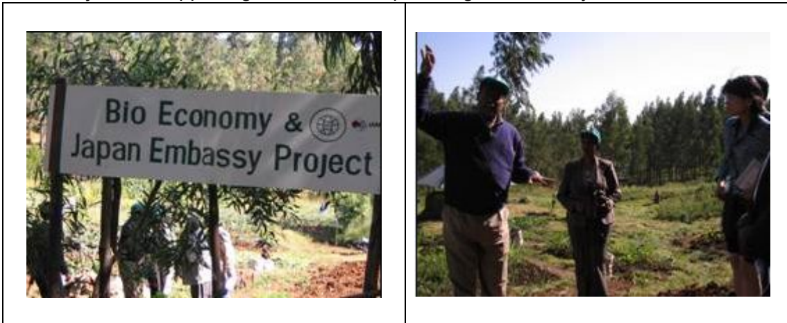
A project receiving "Grant Assistance for Grassroots and Human Security"