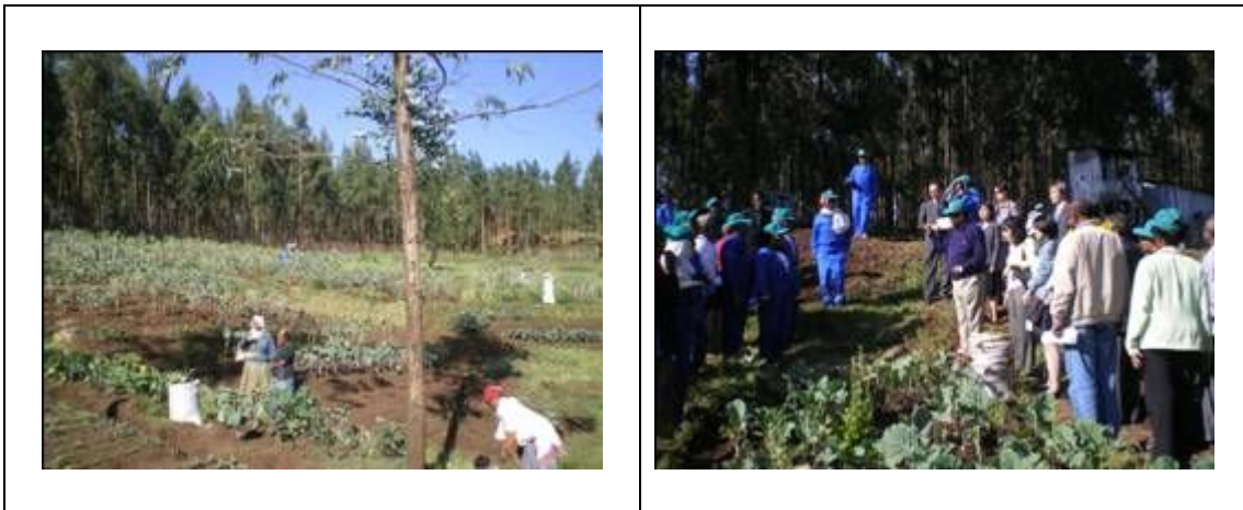
A farm site developed with the "Grant Assistance for Grassroots and Human Security"