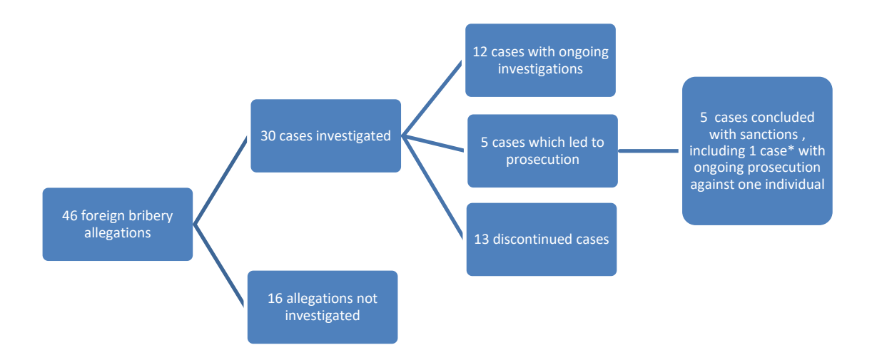
Figure 2: Japan's foreign bribery cases as of June 2019

not indicate whether the MOJ, the DPPO, the NPA or the Prefectural police has dealt with these cases or whether they have led to the opening of criminal proceedings.