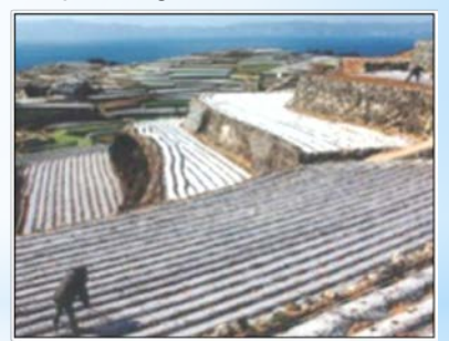
A steep mountainous area with stone piles