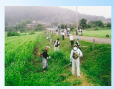
<u>Joint mowing of side slopes</u> In a farmland

Support the farming operations to reduce chemical fertilizer and agrichemical consumption by 50% or more in principle