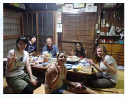
Green tourism 7