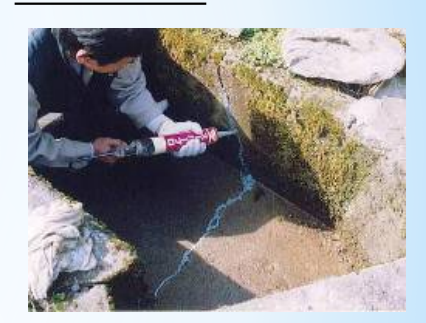
Repairing cracks on a dike