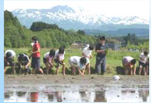
School program to experience farming