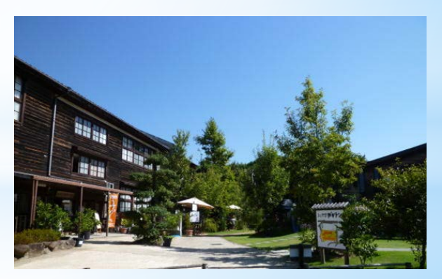
Unused school renewal for green tourism